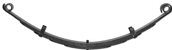
< SHACKLE END – PHOTO 6 – FRAME END (MILITARY WRAP) >

Caused by a steep drag link angle on CJ's. Installing a drop pitman arm may help.