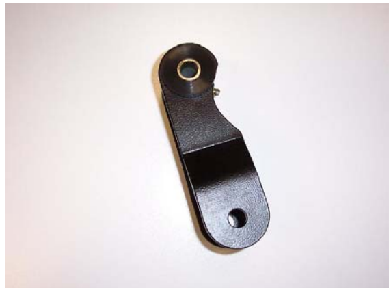
< TOWARD FRONT - PHOTO 5 – TOWARD REAR>