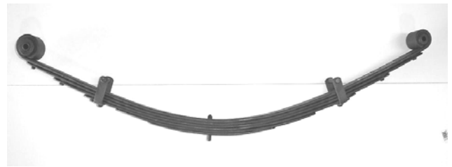
<FRAME END (LARGE BUSHING) - LEAF SPRING PHOTO 3 B