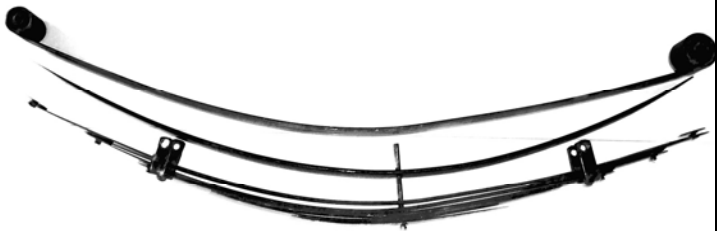
ADD-A-LEAF PHOTO 3 A